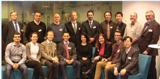
Start-up meeting at KTH in Stockholm

»Cloud manufacturing will be an integret solution to facilitate modular and configurable process planning services to increase robustness of existing processes. Such as pay-as-you-go services and options can be picked from the Cloud when necessary or applicable.